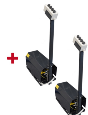
2 x CONTROL UNITS