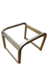
4 x WHEEL STANDS