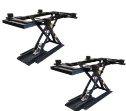
2 x 1330 BENCHES