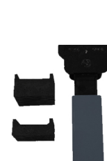
8 x LIFTING PADS